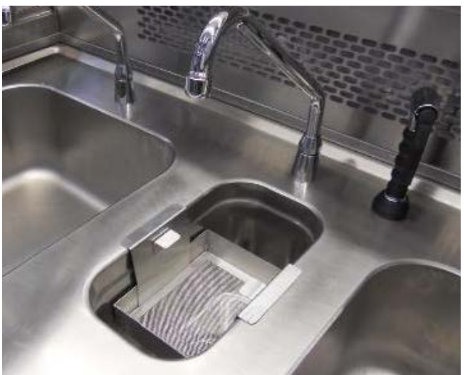
Cover for formalin sink