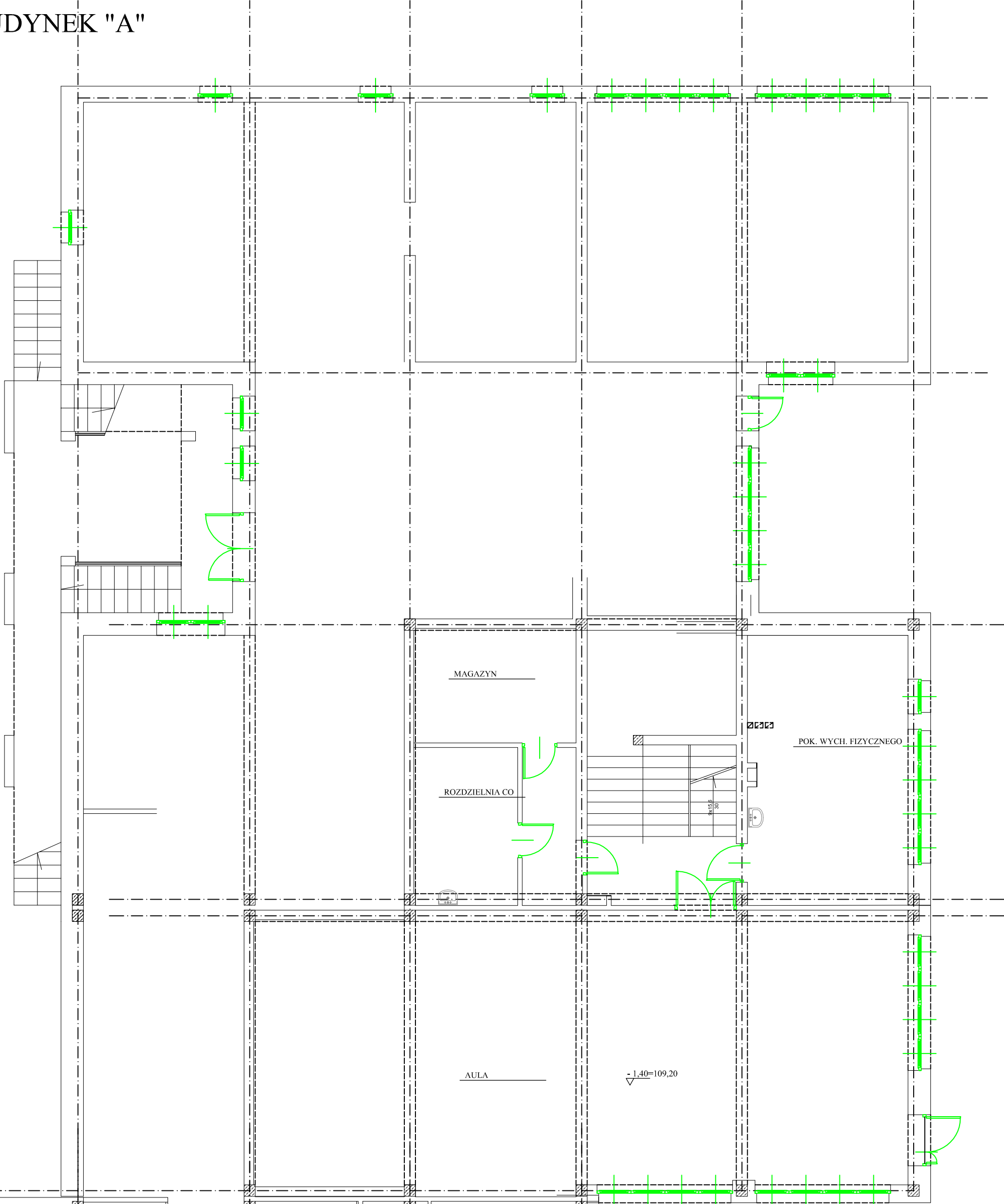
PARTER BUDYNEK "A"